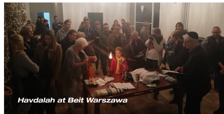
Havdalah at Beit Warszawa

Beit Warszawa/Warsaw • Beit Konstancin/Warsaw Beit Tojmiasto/Gdansk (chavurot) Wrocław Białystok • Łódź • Poznań • Częstochowa Katowice Lublin • Zielona Góra