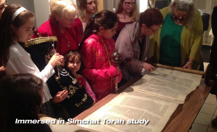
Immersed in Simchat Torah study